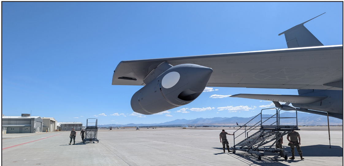
Figure 2: HVAA Pod on KC-135. Credit: U.S. Air Force Photo, November 19, 2025.

a back-haul connection and communicate through BACN's suite of secure line-of-sight UHF radios with assets requiring voice control—including fast movers executing time-sensitive targeting and rotary-wing assets operating below radar line-of-sight. BACN also translates disparate communications links from various platforms across the datalink environment, ensuring that fighters, bombers, ISR aircraft, and ground command centers can share a common tactical picture. In permissive theaters like USCENTCOM, BACN has delivered an invaluable operational impact. Flying continuous orbits over Afghanistan and later Iraq and Syria, E-11 aircraft enabled voice and datalink connectivity between assets that could not otherwise communicate—linking low-flying Army aviation, ground special operations forces, and higher-echelon air operations centers across terrain that degraded line-of-sight radio. 20 At its peak in Afghanistan, a single E-11 sortie could bridge communications for dozens of simultaneous users across the battlespace, effectively multiplying the reach of tactical C2 with minimal additional forward infrastructure. Despite operating with a fleet of just two to four aircraft, BACN sustained around-the-clock availability through persistent orbit scheduling, demonstrating what even