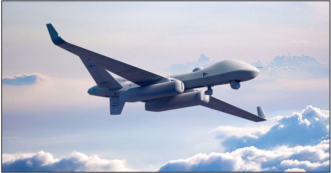
Figure 3: Concept rendition of Saab's AEW&C pods on an MQ-9B.

First, LCAVs must be modular. Standardized payload bays, common power and data harnesses, and plug-and-play sensor and communication suites enable rapid reconfiguration. Payloads can include compact Active Electronically Scanned Array (AESA) radars, which provide high-resolution air and surface search; Ground Moving Target Indicator (GMTI) sensors optimized for detecting low-slow-small threats such as UAS and ground vehicles; passive RF receivers that geolocate emitters without revealing the LCAV's position; Electro-Optical/Infrared (EO/IR) packages for visual identification and targeting; and BACN-like communication modules that extend the mesh communication network into contested airspace (see figure 3). 30 Modularity reduces spare types and enables a “swap-not-fix” sustainment model, which is essential for austere Agile Combat Employment (ACE) basing models. By utilizing self-calibrating sensors and ruggedized line replaceable units (LRUs), the technical burden is shifted from dispersed forward operational locations to their centralized repair main operating bases or organic depots. 31 Maintainers at remote operating locations would perform only organizational-level maintenance—high-level