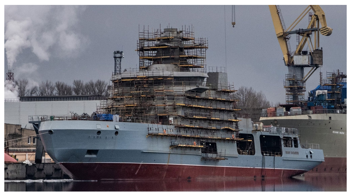
This armed icebreaker patrol ship, the Ivan Papanin, is the first product of Russia's 23550 design project.