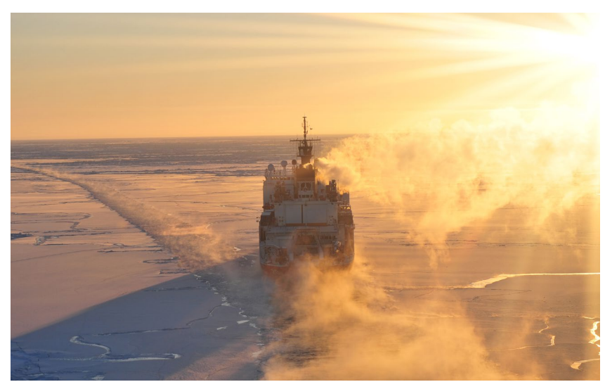
The Coast Guard Cutter HEALY breaking ice near Nome, Alaska

Of course, it is not only the United States that realizes the strategic and geopolitical importance of the High North. Northward expansion has been a historical pursuit of Russia's leaders, and the